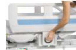
Side Railing up down