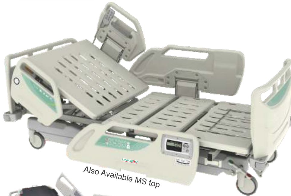
Also Available MS top