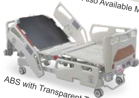
ABS with Transparent Top